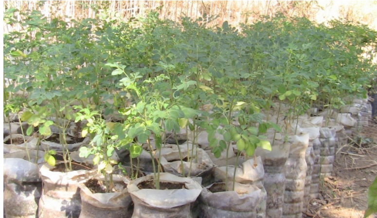
Ordered Seedlings in the Anseba nursery

The department went to the MOA and agreed to get Moringa seedlings from the nursery. It could be used for many purposes.