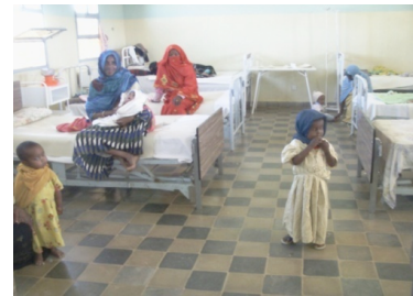
Staffs in morning round in Feledared and children admitted for therapeutic feeding in Halhal