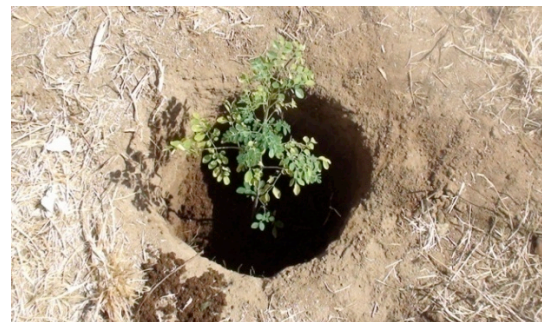
immediately after planting the seedling

The main objective is to increase the food security of households. Therefore, if the households practice it as a food sources and as a medicine, their income will be preserved and will also enjoy sound health.