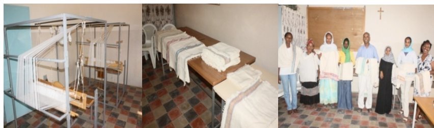
Embroidery section – pilot project

This program was a new program in the department. As a sample we have started it in Ela-Fre by seven hand-weaving machines for seven mothers on February 2012. As it was our first experience, the program had ups and downs at first. The reason was the machines were new and we have no experience. But now everything is smooth and we are planning to expand the program.