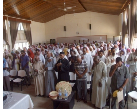
Religious, Government & Community leaders on women's day