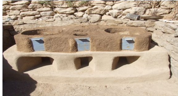
The super structure of the modern energy efficient stove

The reduction of smoke will keep the houses clean and the health of mothers and children will be improved. So, there will be no more health damage by smoke accumulated in the house during cooking.