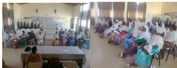
The clients' participation one day workshop

Up to the end of December, 2012, about 48.9% of the loans were returned while the rest of the loan is expected to return in January of 2013.