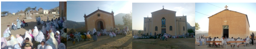
Parishioners attending testimonial sessions by PLWHA