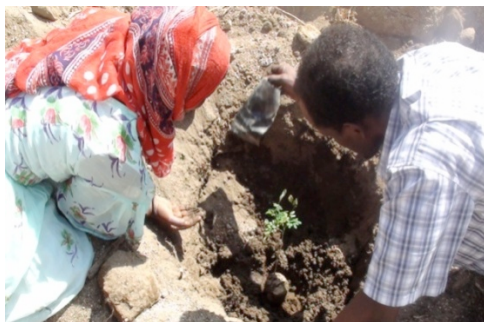
Beneficiary plating the seedlings

In order to expand the above mentioned advantages among the community the department proposed to distribute about 505 seedlings for 240 beneficiaries and the remaining will be distributed for institutions (Kindergarten, Church and Clinic compounds) in the first phase.