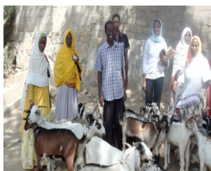
beneficiaries from Bogu and Halibmentel