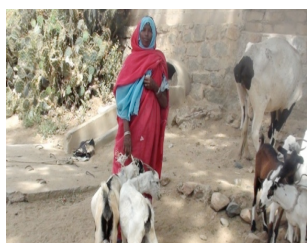
A beneficiary from Titri site

Livestock is a second to crop production as economic means in the Eparchy of Keren. The purpose of the livestock distribution is to encourage the needy households to increase their food stock through milk and other dairy products. The milk will help families as a source of calcium, protein and fats. Therefore, it will play an important role in reduction of illnesses caused by lack of these vital food elements.