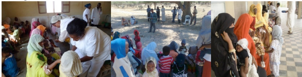
Immunization campaigns in Feledared, Boggu and Halhal respectively

Every year each health facility sets a target for immunization. They evaluate their achievement at the end of every year. The zonal target for immunization this year was to raise immunization coverage rate to 80%.