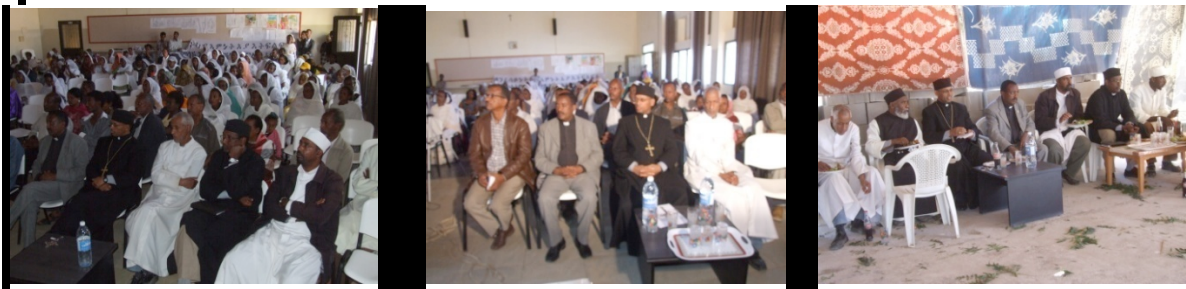
Invited guests watching the programs and enjoying the lunch prepared by the clients.

This year, the parish youths of St. Michael were invited by clients to participate in the celebration. The youths presented spiritual songs, short comedies and poems. The participants were so excited by the spiritual songs. The youths added color to the lively programs of the clients.