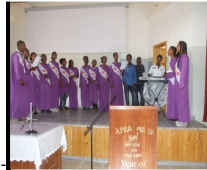
Some activities during the celebration

Participants appreciated the efforts and contribution of the Church. They also expressed their satisfaction for the lively programs presented by the women and hoped that the programs of church to expand and cover large areas in the Zoba.