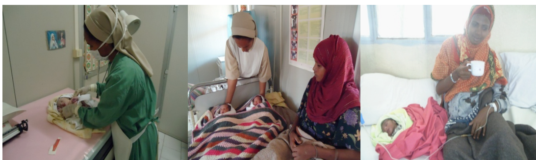
Post partum care in Feledareb and Halhal Health Centers